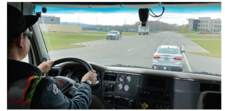
A driver testing Pronto's ADS equipped truck