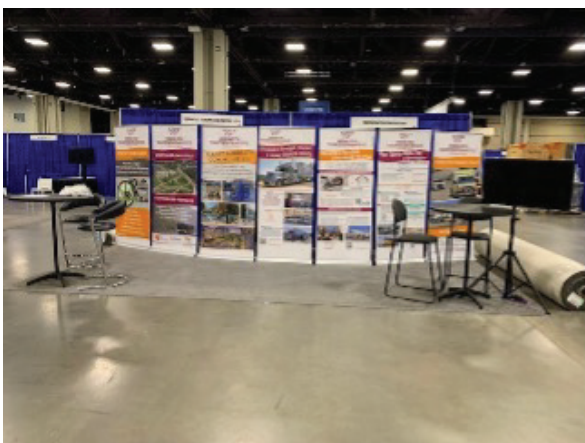
ITS America exhibitor booth

The CONOPS Roadshow Demonstration also featured an exhibitor booth that highlighted the research and real-world applications of the Division of Freight, Transit, & Heavy Vehicle Safety (DHVY) at VTTI. DHVY researchers solve complex and meaningful heavy-vehicle problems through deployment, testing, analysis, education, and outreach. With a focus on addressing real-world challenges, this division follows a research-to-practice philosophy by translating research findings into actionable countermeasures—most recently with a strong focus on cutting-edge driver assistance and automated truck and bus technologies. With a long history of establishing key partnerships across a variety of industry and government stakeholders, DHVY has conducted innovative research-based initiatives that support the safety, health, and well-being of truck and bus drivers and efficient and sustainable transportation for all who share the roads with them. The exhibitor booth highlighted DHVY research and outreach initiatives by showcasing a looped video summary of division projects and priorities. DHVY researchers were at the booth available to answer attendee questions and hand out research briefs, project pamphlets, and DHVY giveaway items.