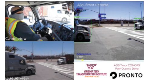
Port queuing demonstration