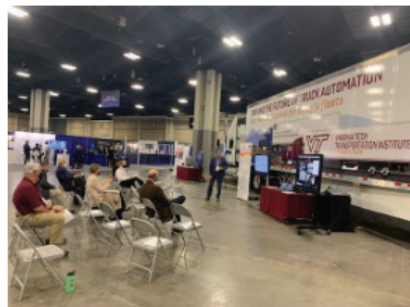
ITS America cross-country demonstration presentation