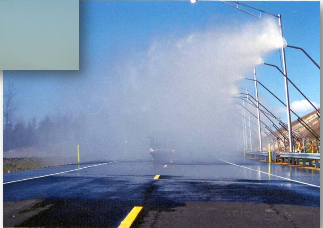
The Virginia Smart Road